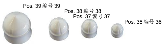
Fig. 05 图05