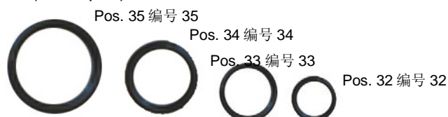
Fig. 04 图04