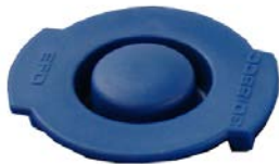
Pos. 43-46 编号 43-46