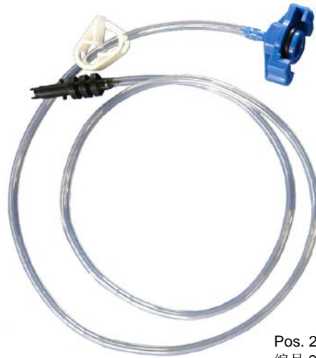
Pos. 23-26 编号 23-26