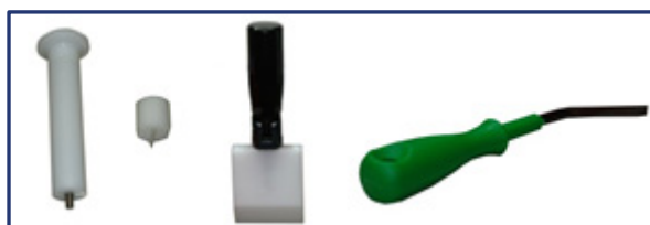
Tools for disassembly of fixtures