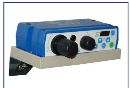
Dispenser unit for liquid rubber