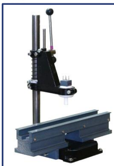
Punch-out press for contact modules