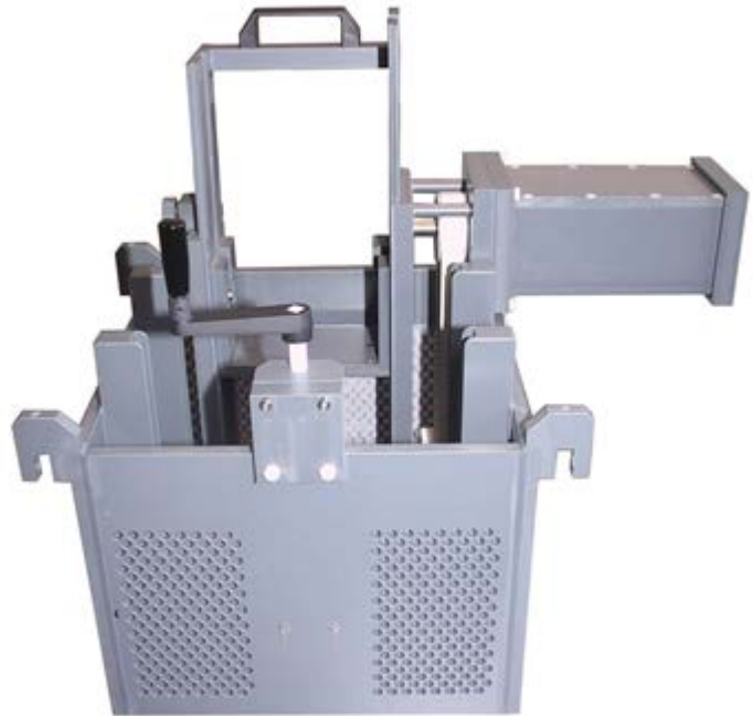
Fig. 1 (Pos. 01)

Pos. Quant. Unit Designations, dimensions, etc.