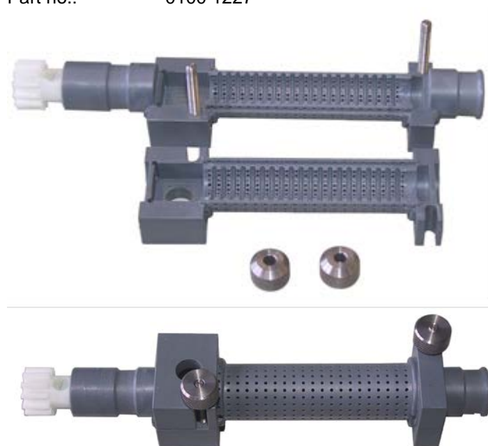
Fig. 5 (Pos. 50-91)