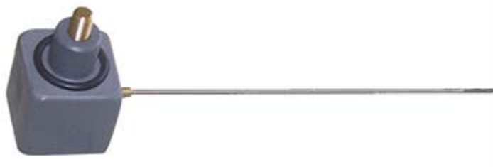
Fig. 3 (Pos. 03-04)