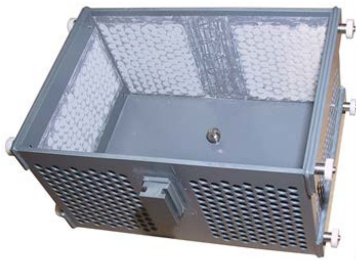
Fig. 7 (Pos. 93)

93 pc Holding cassette for diamond tackdown fixture and diamond-retaining sieve Part no.: 0100 0189 Customs-Declaration no.: 85439000