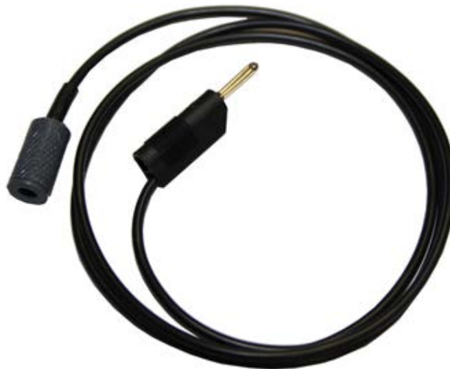
Fig. 6 (Pos. 92)

92 pc Contact plug for contact and holding block for flexible discs Part no.: 0100 0167 Customs-Declaration no.: 85444290