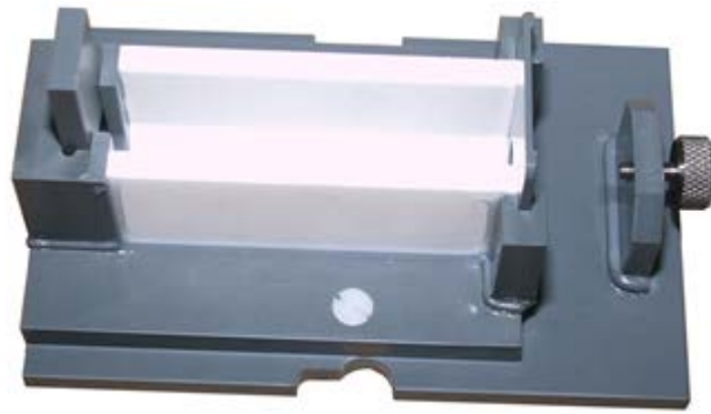
Fig. 8 (Pos. 94-110)

Kindly indicate the disc thickness when placing your order. One diamond tackdown fixture for each disc thickness.