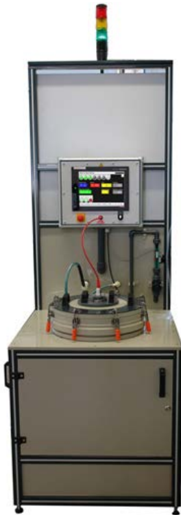
旋转式凹版电镀装置 RBE 1/45-49/001 Rotational reverse-plating unit RBE 1/45-49/001 - 一个带有盖子的旋转电镀容器 1 rotational plating vessel with lid - 带有膜片阀的流量计，用于调节电解液流量 Flow meter and diaphragm valve for electrolyte flow regulation - 旋转 最大 500 转每分 Rotation max. 500 rpm - 旋转式凹版电镀调控装置 RBS 10A-45/0011 rotational reverse-plating control RBS 10A-45/001