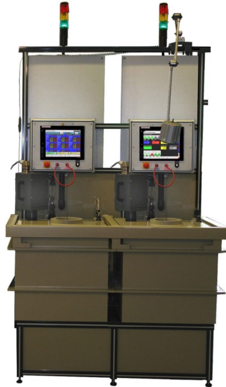
镀厚镍装置 DVE 2/56-56-50/001 Thick-nickel plating unit DVE 2/56-56-50/001 - 2 个带有周边抽吸装置的电镀槽 2 electro-plating tanks with rim exhaustion - 2 个水平旋转装置 2 horizontal rotation units - 2 个镀厚镍调控装置 DVS 10A-45/001 2 thick-nickel plating controls 带有内置驱动调控装置 with built-in motor control