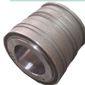
电镀金刚石成型滚修整轮 Diamond profile dressing roller