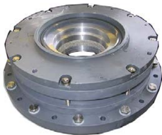
旋转式凹版电镀装置装有凹模(最大模 外径 250mm) Rotational reverse-plating fixture With reverse-plating mould max mould outer Ø 250 mm)