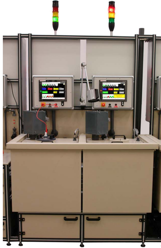
镀厚镍装置 DVE 2/56-56-50/001 Thick-nickel plating unit DVE 2/56-56-50/001 - 2 个带有周边抽吸装置的电镀槽 2 electro-plating tanks with rim exhaustion - 2 个水平旋转装置 2 horizontal rotation units - 2 个镀厚镍调控装置 DVS 10A-45/0012 thick-nickel plating controls DVS 10A-45/0012 带有内置驱动调控装置 with built-in motor control