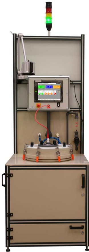
旋转式凹版电镀装置 RBE Rotational reverse-plating unit RBE - 一个带有盖子的旋转电镀容器 1 rotational plating vessel with lid - 带有膜片阀的流量计，用于调节电解液流量 Flow meter and diaphragm valve for electrolyte flow regulation - 旋转 最大 500 转每分钟 Rotation max. 500 rpm - 一个旋转式凹版电镀调控装置 RBS 10A-45/001 Rotational reverse-plating control RBS 10A-45/001