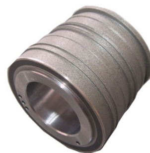
电镀金刚石成型修整滚轮 Diamond profile dressing roller