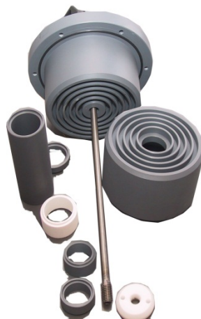
阳极棒系统(组件) Anode rod system (components)