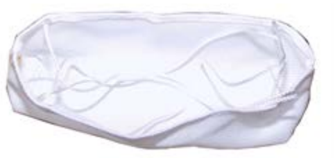
Fig. 11 (Pos. 116) 图11 (编号116)