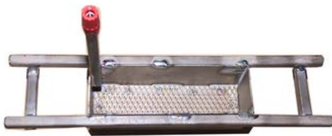
Fig. 10 (Pos. 115) 图10 (编号115)

Pos. 编号 Quant. 数量 Unit 单位 Designations, dimensions, etc. 产品描述, 规格等