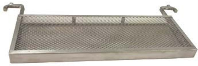
Fig. 9 (Pos. 113) 图9 (编号113)

113 pc Titanium anode basket flat 钛阳极扁篮 Dimensions 规格: 430 x 20 x 150 mm Part no.产品编号: 0100 0211 Customs-Declaration no.: 81089090 报关编号: 81089090