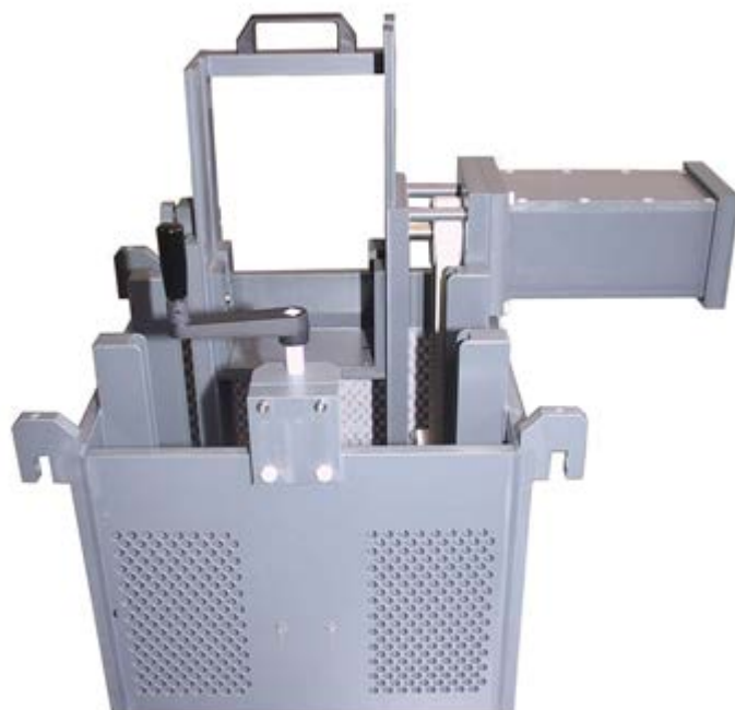
Fig. 1 (Pos. 01) 图01 (编号01)